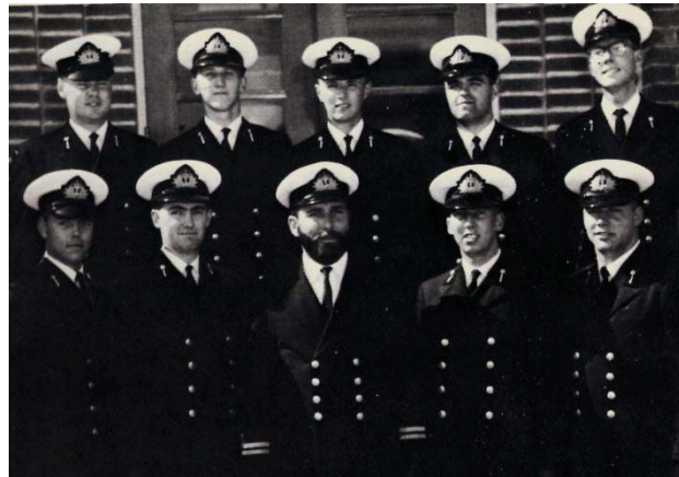
Yukon Division, The Last UNTDs 1968

Vessels, then headed west to join the 2nd-year cadets at Naden . They had their own Division ( Yukon ), and were commissioned at the end of the summer along with the 2nd-year cadets. So, it took 1 summer to get their commissions. True 90-day wonders."