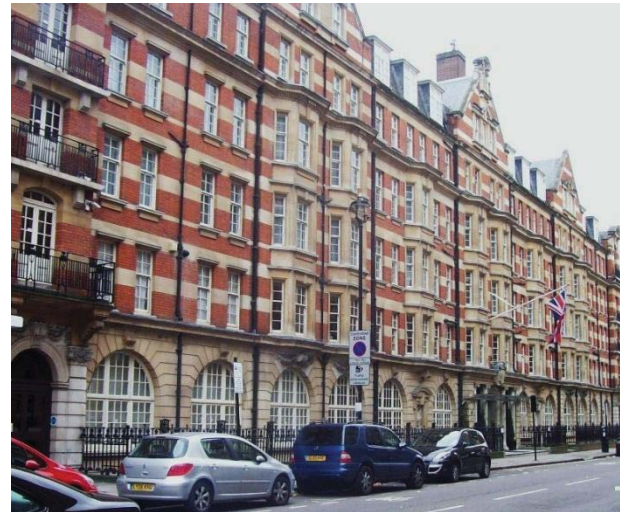
Victory Services Club, central London.

The contingent boarded another 'pusser-bus' at the terminal and arrived at the Victory Services Club VSC, our London headquarters, in the early afternoon. The VSC, located in the Marble Arch area of London, is the largest All-Services, All-Ranks Club in the UK. The plentiful accommodation, dining, bar facilities and Military ambience, made it the perfect choice for our large group. After everyone had checked in and gotten squared away, a UNTD Reception was held in the Trafalgar Room.