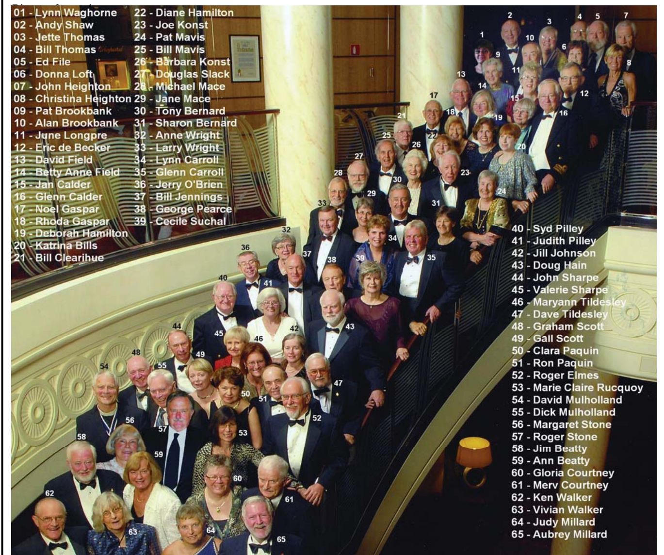
UNTD QUEEN MARY CRUISE