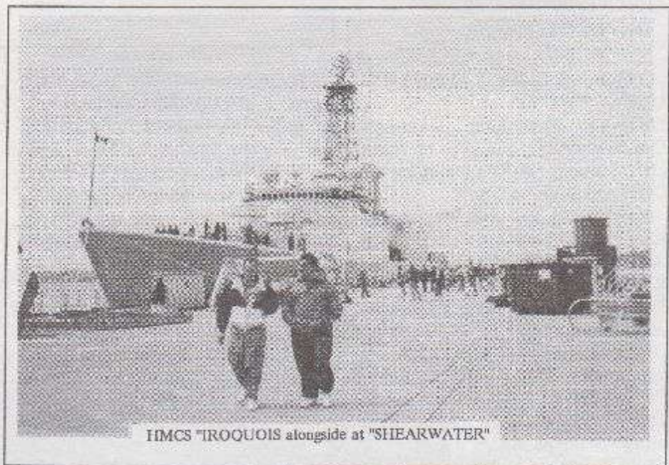
HMCS "IROQUOIS" alongside at "SHEARWATER"