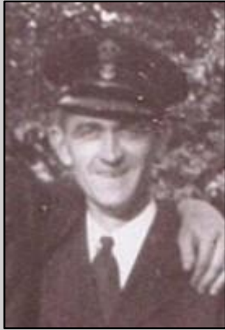
ERA Thomas W.J. Butterfield. Do you have a better photo you can share? Please submit to CSV.CVMC@gmail.com