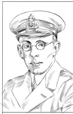
COMMANDER ROLAND BOURKE VC, DSO, RCNVR