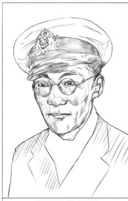
LIEUTENANT-COMMANDER WILLIAM KING LOWD 'LO' LORE, RCN