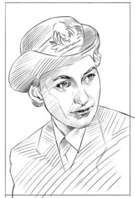
COMMANDER ISABEL MACNEILL OC, OBE, WRCNS