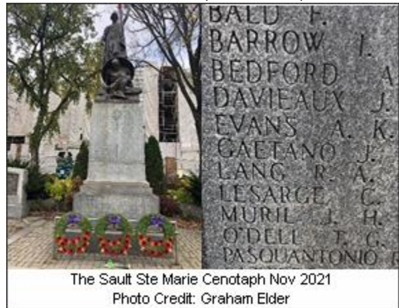
The Sault Ste Marie Cenotaph Nov 2021

From little towns, in afar land, we came, To save our honour and a world aflame; By little towns, in a far land, we sleep, And trust those things we won